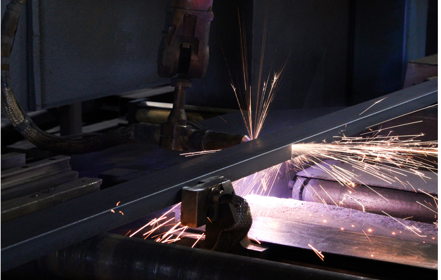
PythonX processing a channel